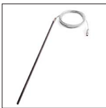
A00000394 Pt100 Probe XL Ø 6 500mm