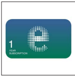
E00010012 VELP Ermes 1 Year Connection