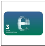
E00010036 VELP Ermes 3 Year Connection