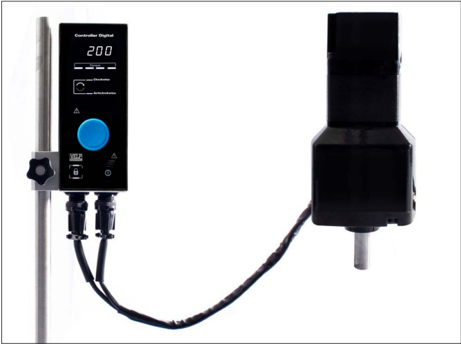
CONTROLLER Digital + Motor 10 lb*in, 471 rpm , 1/11 HP - 24V