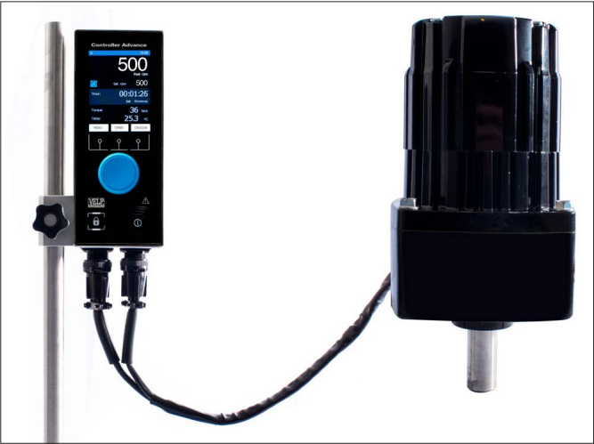
CONTROLLER Advance + Motor 55 lb*in, 250 rpm , 1/4 HP - 24V